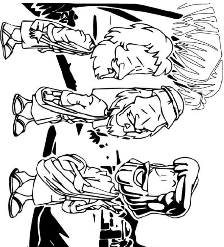
"It's Jesus! Burning Hearts & Big Expectations" Luke 24:13-35. Written by Kristin Schmidt . Lesson Plan Copyright © 2023 The Sunday School Store , Page 14