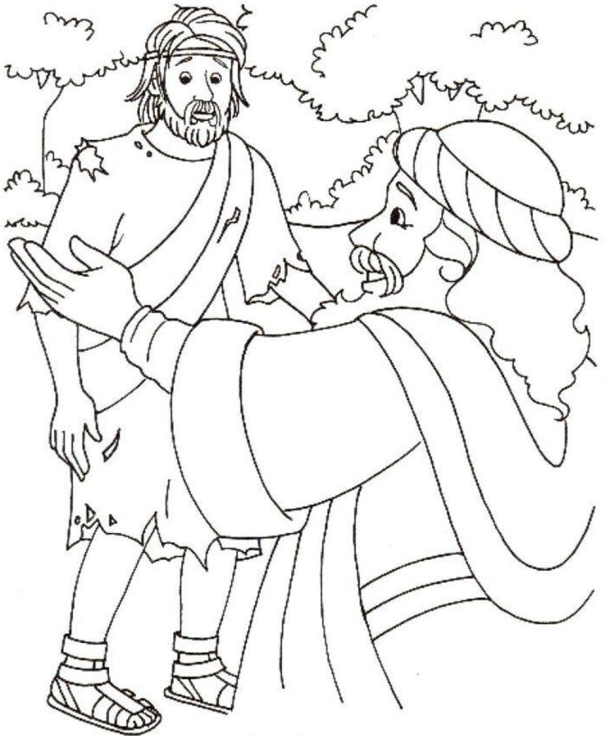
The Prodigal Son