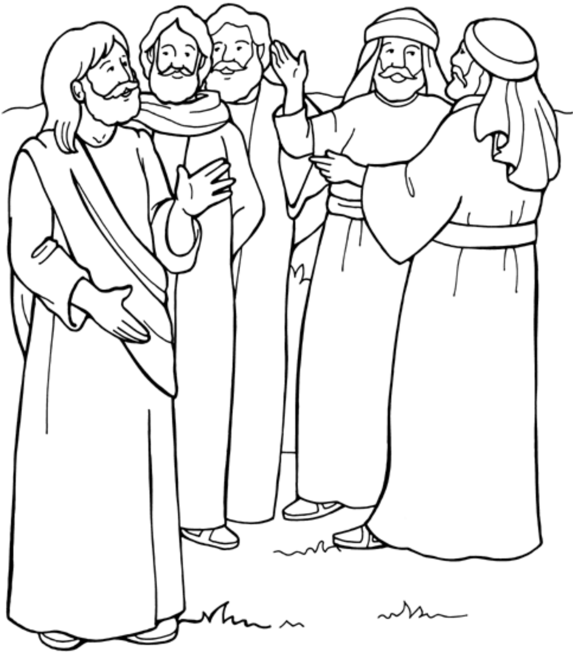
Jesus' First Followers John 1