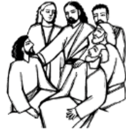
Calling the Twelve to him, he sent them out two by two. Mark 6:7 (NIV)

Each number represents a letter of the alphabet. Substitute the correct letter for the numbers to reveal the coded words.