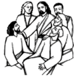
Calling the Twelve to him, he sent them out two by two. Mark 6:7 (NIV)