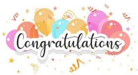
Liturgy Mag Dec 2023

If you wish to place a notice in our parish newsletter, please email the parish office by Wednesday.